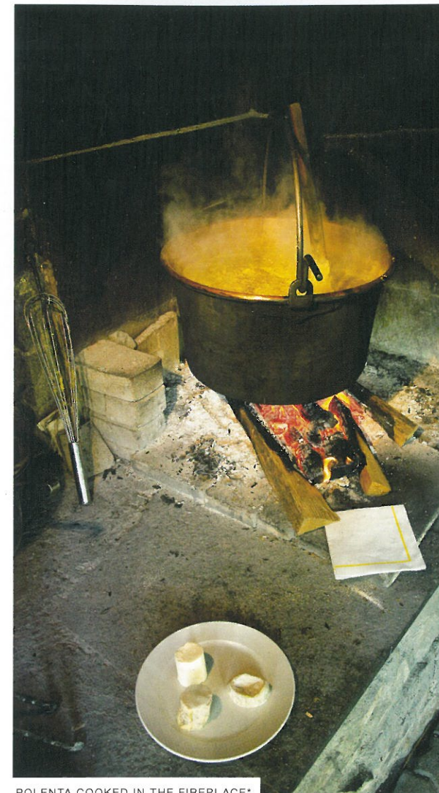
POLENTA COOKED IN THE FIREPLACE*

The expert in the art of making Merlot wine in all its facets is the cellar Valsangiaco F.lli SA in Mendrisio. With over 180 years of experience, the company has learned to take advantage of the characteristics of the territory and microclimate of the Mendrisiotto vineyards to shape this noble grape with a Bordeaux origin and produce wines that range in character from soft and fruity to structured and powerful.