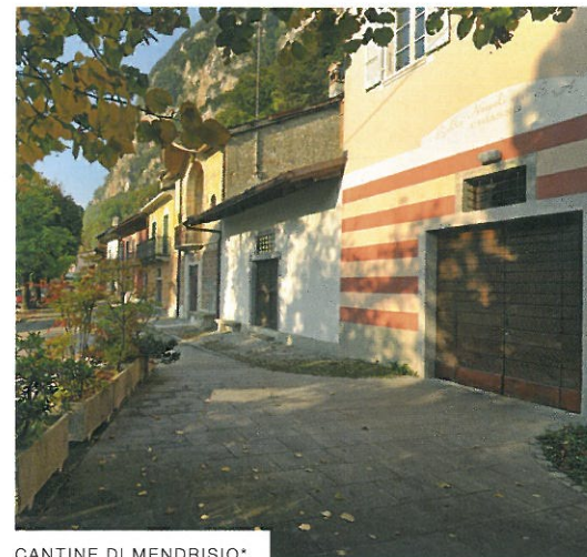
CANTINE DI MENDRISIO*

The arrival of autumn is the perfect opportunity to learn about the typical regional cuisine where the polenta, cooked with homegrown flour, is accompanied by traditional local peasant dishes such as Luganighetta (a type of artisanal sausage) with onions, brasato, salami or ossobuco di vitello.