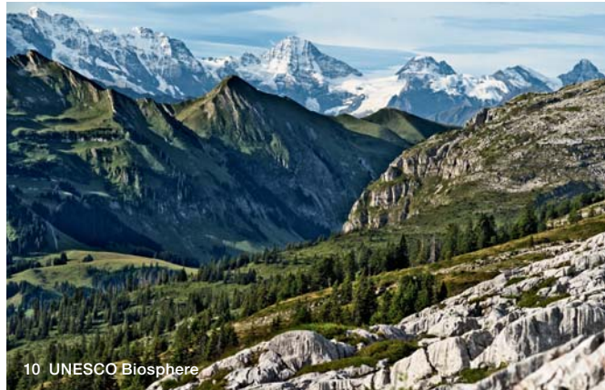
10 UNESCO Biosphere