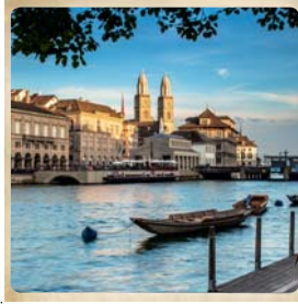
Banks of the Limmat River, Zurich