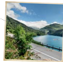
Marmorera reservoir, Graubünden