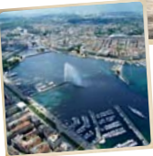
Lake basin, Geneva